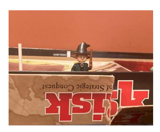
Admiral Minerva McGonagall giving her speech.

"We have won against Wu-Wu-Wu Zap! Hooray! Hooray! We have won against Wu-Wu-Wu Zap! Hooray! We will have to record it in books to commemorate this great battle. For our troops and battle equipment are exhausted."