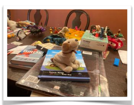
Dog howls at victory.