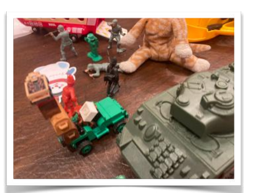
The triumphant troops returning from Uni Fort.