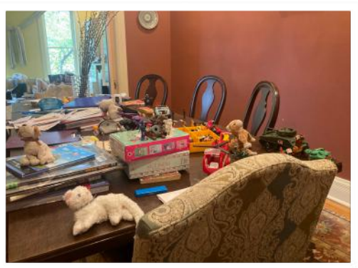
Onlookers of the battle cheering at victory.