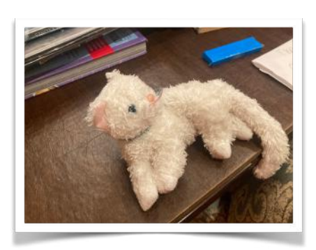
An injured Starlet 😥